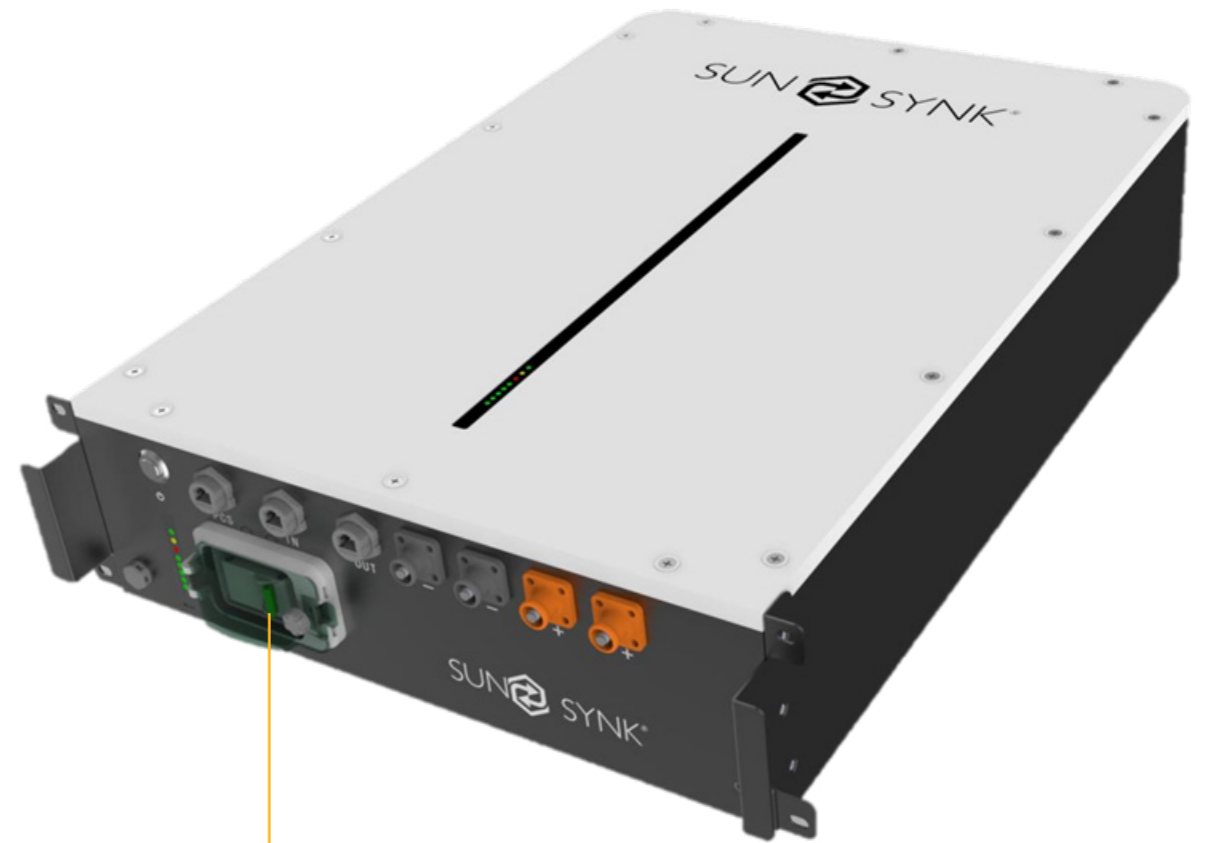
DC 125A Circuit Breaker

[3] The warranty is due whichever reached first of warranty period or energy throughout.